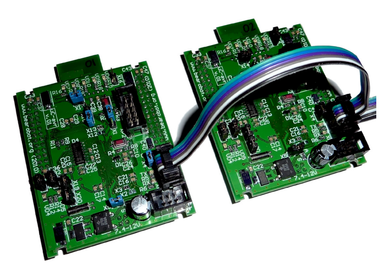
Fig. 3. Hardware control units – interconnected embedded boards example.

Boards are based on AVR-core microcontroller and offer a wide range of communication capabilities which can be easily accessed with a number of connectors. No task specific parts are included onboard. Most of microcontroller ports' pins are traced to two special connectors meant to be standard for all other control boards with different core microcontroller. This standard allows a number of functional boards to be developed by team members while working on another project or use functional boards developed for other projects as well. Special effort was put in hardware configuration abilities of the boards with jumpers and soldered components, so that most of pins naturally used for onboard needs can be also accessed within standard connectors.